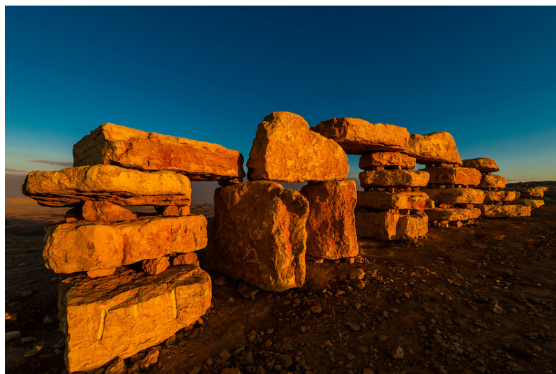
One of approximately 40 works in the Desert Sculpture Park, in the Negev, Israel. Navigable only by 4x4, the park is built on the rim of Ramon Crater, the world's largest karst erosion cirque.

With parks and sculpture gardens in the Asian region totaling over fifty, there is bound to be one or two in the country or city you are visiting next. From Japan to Israel, we take a look at nineteen parks that focus on work by contemporary Asian sculptors.