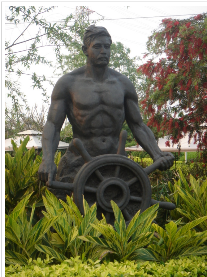
'The Helmsman' by Pan He reputed to be 'The Michaelangelo of China', as seen in Pan He Sculpture Garden, Guangzhou, China.